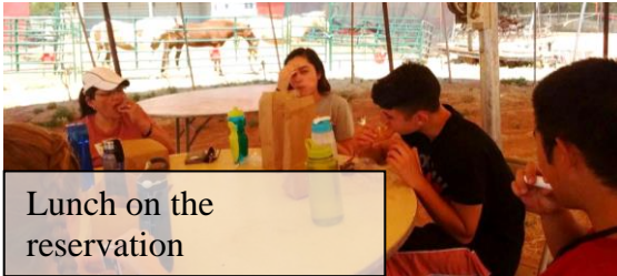
Lunch on the reservation

More pictures from our 2017 Mission Team!