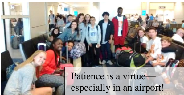
Patience is a virtue— especially in an airport!