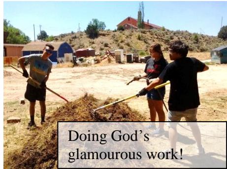
Doing God’s glamorous work!