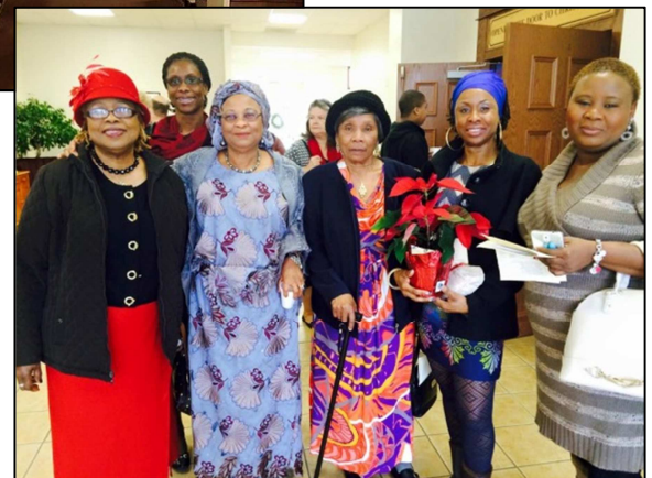
Christmas 2014 at St. Mark's